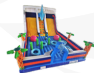
Model: Ocean Life Dimensions: 12x8x6H m Available: 1 pcs Blower: 2x1500W (included)