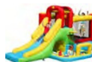
Model: Multifunction 1 Dimensions: 5x4x3H m Available: 2 pcs Blower: 1100W (included)