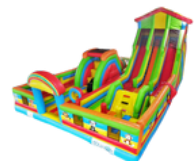
Model: Rainbow World Dimensions: 14x9x8H m Available: 1 pcs Blower: 3x1500W (included)