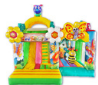
Model: Funny Bugs Dimensions: 5x5.6x3.5H m Available: 2 pcs Blower: 1500W (included)