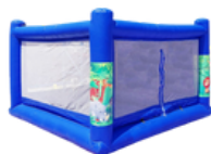
Model: Savana Dimensions: 3x3x2H m Available: 1 pcs Blower: 680W (included)