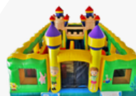
Model: Castle of Dreams Dimensions: 10x8x5H m Available: 1 pcs Blower: 2x1500W (included)